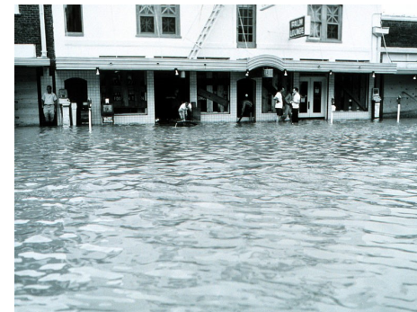
Damage and Flooding in Brownsville, Texas from Hurricane Beulah.

What had happened? As this mighty destructive power was steadily moving toward us, a yet mightier power was also in operation – the power of prayer. God's people throughout the world were praying for the Christians of this Bible institute. As the hurricane neared the coast, it was stopped and for a couple of hours remained in the same position, gathering momentum in speed as if preparing for the kill. When it started to move again, it suddenly changed its course and moved northwest, away from us. The eye of Beulah had passed us by seventy miles! God had answered prayer.